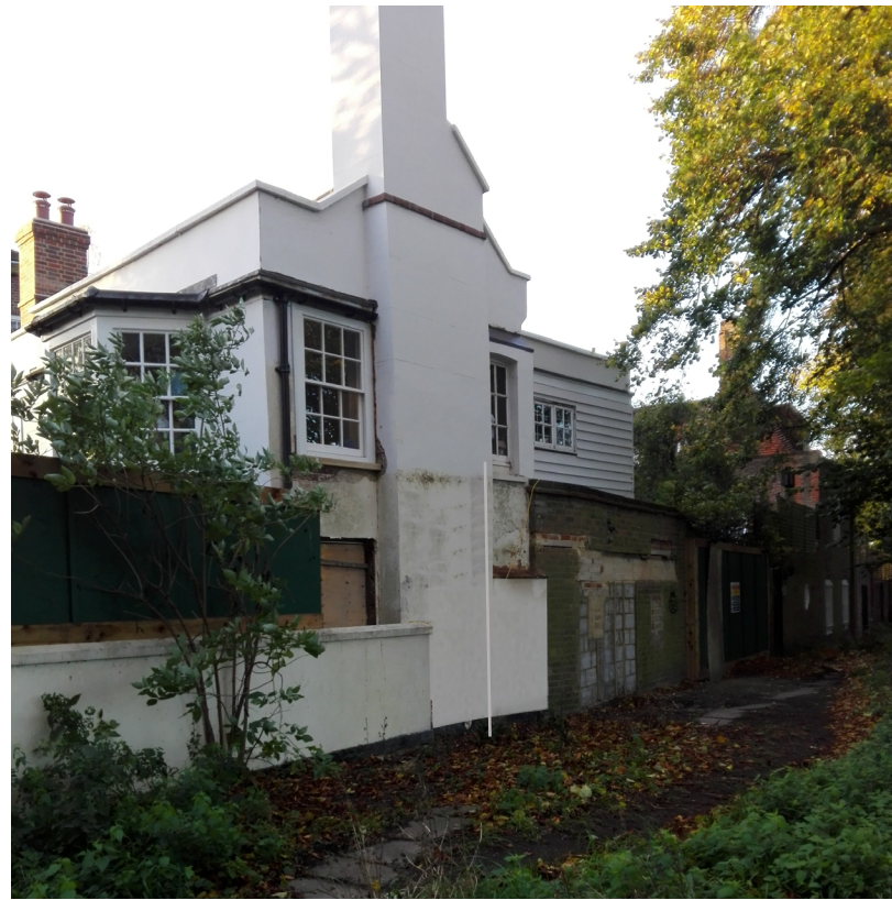
LOCATION A WITH POLE